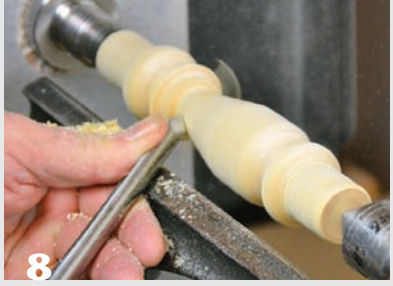
Working from the tailstock toward the headstock, shape the spindle elements with a gouge and skew chisel.

The vase shape at the top has a nice tension and turns its lip at 90 degrees, but the V transition to the ball is too sharp. The top half of the ball is rounder than the bottom half; it would look more spherical if the height matched its diameter. Okay, turn another spindle and keep practicing.