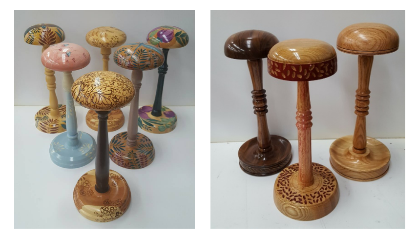
These wig stands were made by the Central Illinois Woodturners

Check out the attached Excel sheet of organizations who have already been contacted for distribution of the wig stands. Most organizations are giving out wigs in person and would be giving out the wig stands at the same time. See what organization is near your club—you can deliver the wig stands either as an individual club or gather regionally. If nothing appears to be near your location, Google "free wig in your state" to find a local resource.