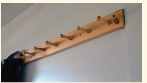
A hat rack featuring Shaker-style pegs is a practical turning exercise and another good place to park hats.

• Mount a peg blank between centers and round it with a roughing gouge. Establish the tenon and shape the peg details with a gouge and skew chisel. Each peg is an opportunity to practice parting off cleanly. If you use a scroll chuck, add about 2" (5cm) to the blank length to provide material for the jaws to grip, and clearance to avoid those spinning jaws. Use the tailstock for support.