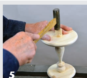
Trim the tenon with a skew chisel. If the tenon is loose, add a narrow saw kerf and tap in a slender wooden wedge.