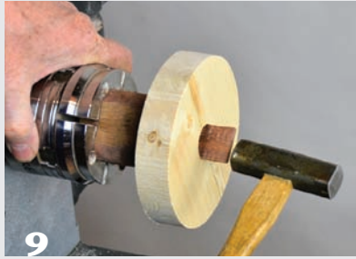
An undersized tenon on the jam chuck can be tightened with a wedge driven into a saw kerf.