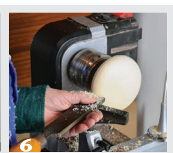
A freshly sharpened scraper produces paper-thin shavings and a smooth surface on the face-turned discs.