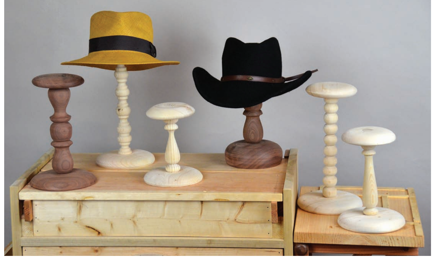
Hat and wig stands ranging from 7" to 14" tall, with 6" bases and 5" tops.

R ummaging through the library at the Center for Art in Wood in Philadelphia, I stumbled across several 100-year-old woodturning textbooks. They were filled with turning exercises and projects. Wanting to improve my skills with a gouge and skew chisel, I tried some of the traditional spindle exercises ( Photo 1 ).